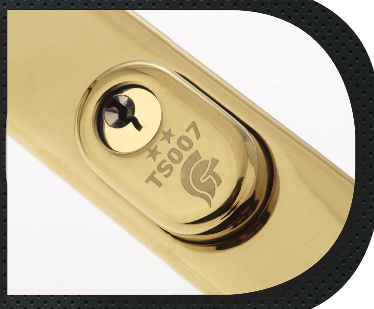
Product Codes 0749